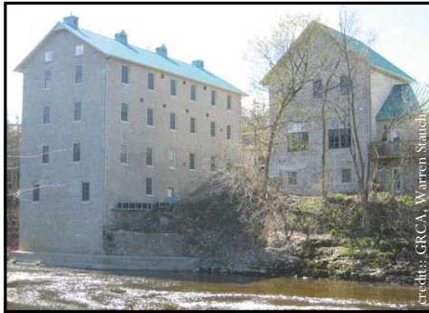
ST. ANDREWS MILL, FERGUS 1850C (CONDOMINIUM COMPLEX)

In order to determine the best fit for the mill in Caledonia, one of the objectives of this project has been to find out how other mills have been adapted into new uses. Currently a review of ‘best practices’ of mill re-use across Ontario is underway. Findings will be out in